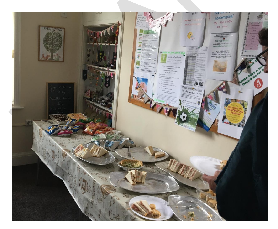
[Lunch provided by Healthwatch North Yorkshire to a local voluntary organisation]

As the CCG was already distributing large numbers of surveys to a broad segment of the population, it was decided that there was no need to replicate their work. Instead, Healthwatch conducted a series of focus groups and interviews, specifically looking to speak to individuals who would be most affected by the plan— service users, carers, and service providers. This was done through contact with voluntary organisations and snowball sampling (a term for interviewees being asked to recommend other individuals that might want to speak with Healthwatch).